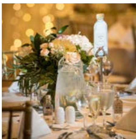
MEMORIES — TO LAST — A lifetime