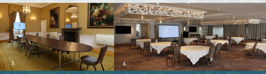
1. Queens Room 2. Castle Room 3. Lothian Room 4. Dalmahoy suite 5. Boardroom

For more information and to book, please call: 0131 333 1845 or email: conferenceandevents@dalmahoyhotelandcountryclub.co.uk