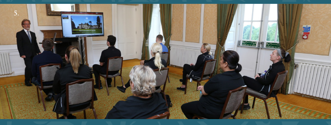
Dalmahoy Hotel & Country Club, Just off A71 near Ratho, EH27 8EB